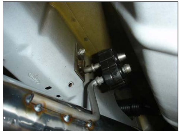
Fig # 3

**MagnaFlow strongly recommends professional installation, and any cutting or modification to the valence or fascia should be conducted at your own risk.